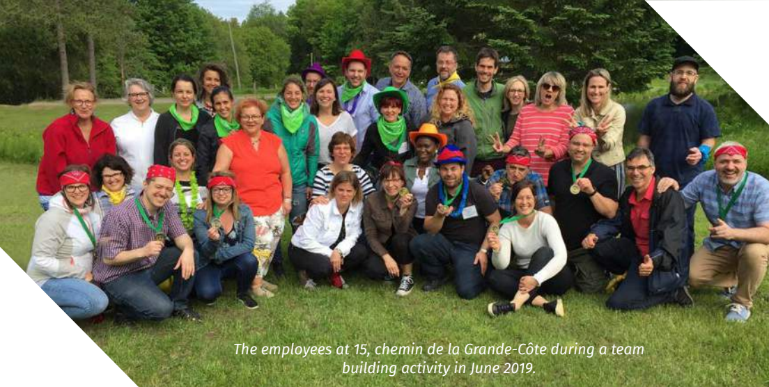
The employees at 15, chemin de la Grande-Côte during a team building activity in June 2019.